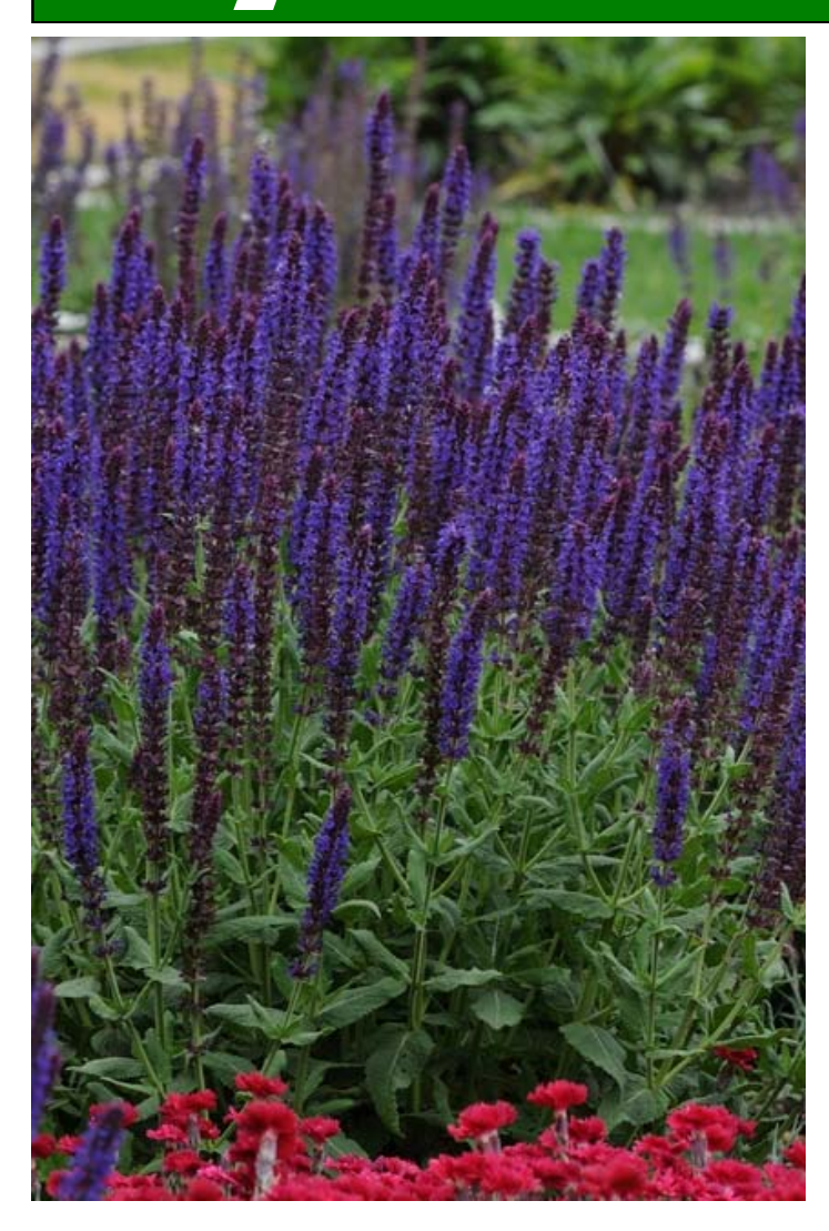
Looking for a summer show of intense color? Easy to grow, salvias perform best in full sun.