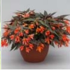
Night Fever Papaya